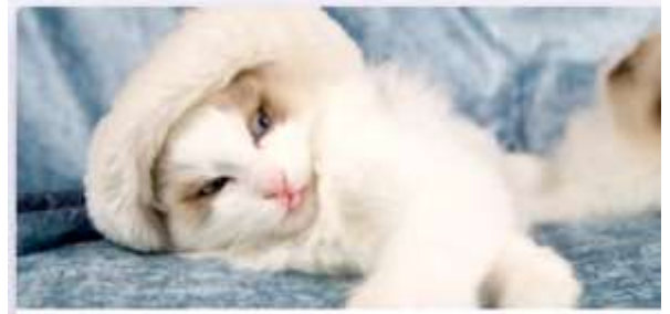
Monday, Dec. 21, 2020 Humbug Day / Look on the Bright Side Day

For many people, Christmas can be an incredibly stressful time of year. Humbug Day encourages a controlled venting of all that stress before Christmas so that you can enjoy the festive season to the fullest. After venting, you can also celebrate Look On The Bright Side Day . It's quite normal to feel a little down on this day since it falls around the winter solstice, which means things tend to get a little cold and cloudy outside. But, fret not, because every cloud has a silver lining. Being optimistic is scientifically good for our bodies and minds. Look On The Bright Side Day is all about seeing the glass as half full!