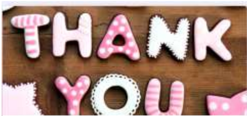
Saturday, Dec. 26th, 2020 Thank You Note Day

To celebrate Thank You Note Day all we have to do is pass around cards or notes thanking our family members and friends for the gifts that they've given us and the love we all share each and every day. Thank You Note Day is a silly, yet wonderful little holiday that makes time with our friends and families a whole lot more cheerful, fun, and all around happy.