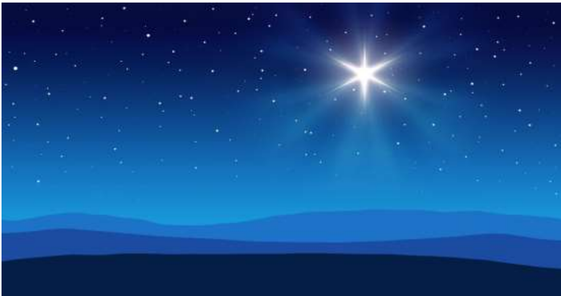
Jupiter and Saturn will appear closer together in Earth’s night sky than they have been since the Middle Ages.