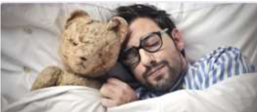
Sunday, Jan 3 rd , 2021 Festival of Sleep Day

The Festival of Sleep Day was encouraged so that people could enjoy some relaxation and much-needed "shut-eye" after the holiday period. The Festival of Sleep Day ensures that you have all of the time that you need to recoup and recover from the holiday season. Nobody is quite sure when this holiday started, but it was founded by someone who had a profound and deep love of sleep.