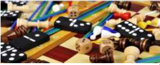
Sunday, Dec. 20, 2020 Games Day

Every day should be celebrated. Here are some of the world's weird, funny, wonderful, unknown and bizarre holidays coming up. Check out Days Of The Year or National Today for more.