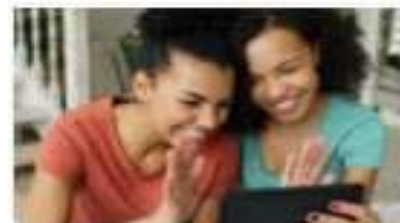
Monday, Dec. 28, 2020 National Call a Friend Day

National Call a Friend Day reminds us all to take a few minutes, pick up the phone, and call that friend you've been meaning to get back in touch with.